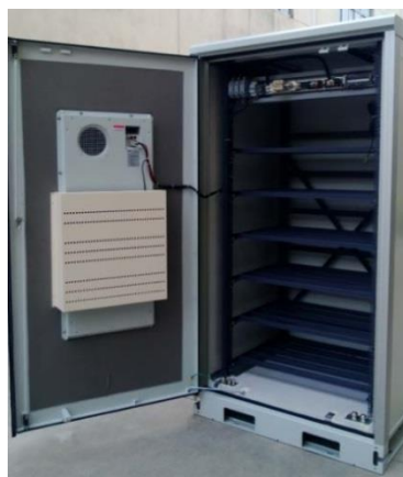
1200 Ah Battery Cabinet