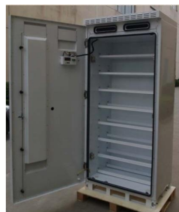
600 Ah Battery Cabinet