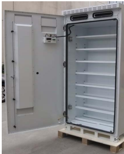
Open door with DC Cooling